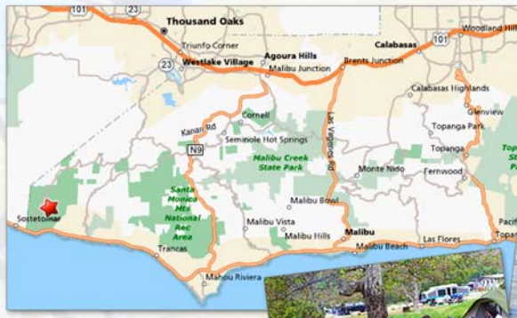
The park is located 28 miles northwest of Santa Monica on the Pacific Coast Highway with easy access to the beach.

A: You can stay all day long, through the night meeting. You can't stay overnight unless you pay.